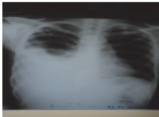
Fig. 1 – Chest radiography (X-ray) – large pleural effusion to the height of the front corners of IV ribs.

Chest X-ray showed large right sided pleural effusion up to the height of the 4th rib front corners (Figure 1).